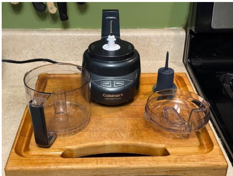
Fig. 1. Gather components and ingredients near electrical outlet.

To demonstrate how to use the Mini-Prep Plus 24-Oz Food Processor, Figures 1-12 below will walk through the steps needed to grind whole coffee beans: