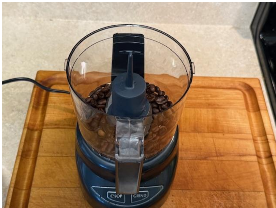
Fig. 5. Pour coffee beans into bowl.