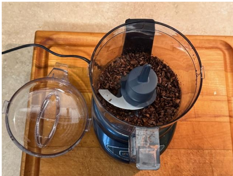
Fig. 9. After grinding beans, remove lid to see consistency.