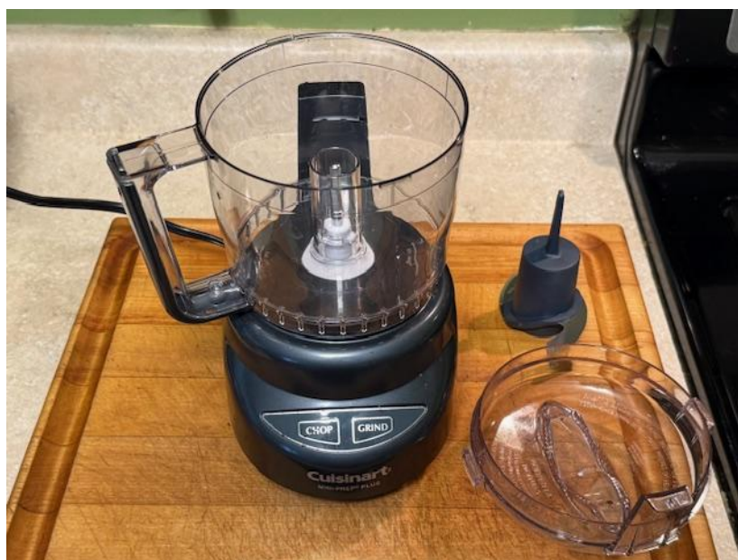
Fig.2. Place bowl onto the base unit.