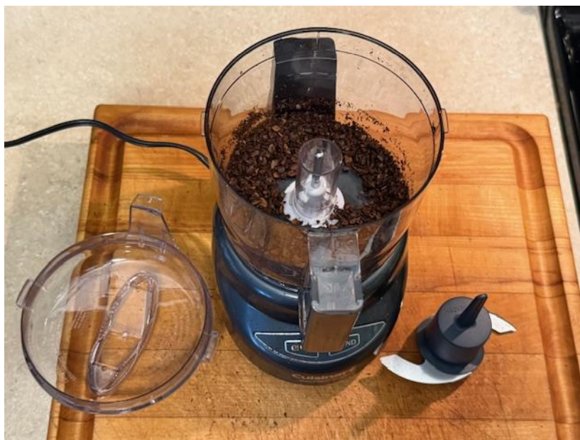
Fig. 11. With beans at desired consistency, unplug power, remove lid and blade.