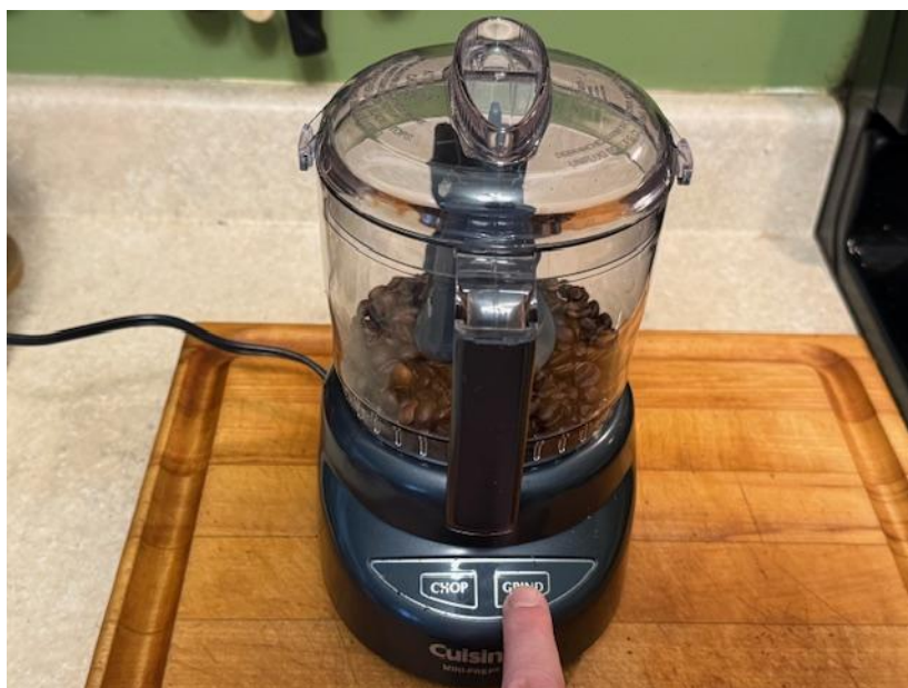
Fig. 8. Press grind button and hold for 10 seconds to grind beans.