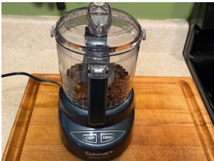
Fig. 6. Put lid on bowl and turn to lock in place.