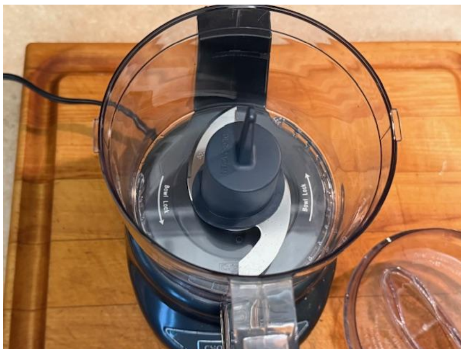
Fig. 4. Place blade attachment into bowl and turn to secure.