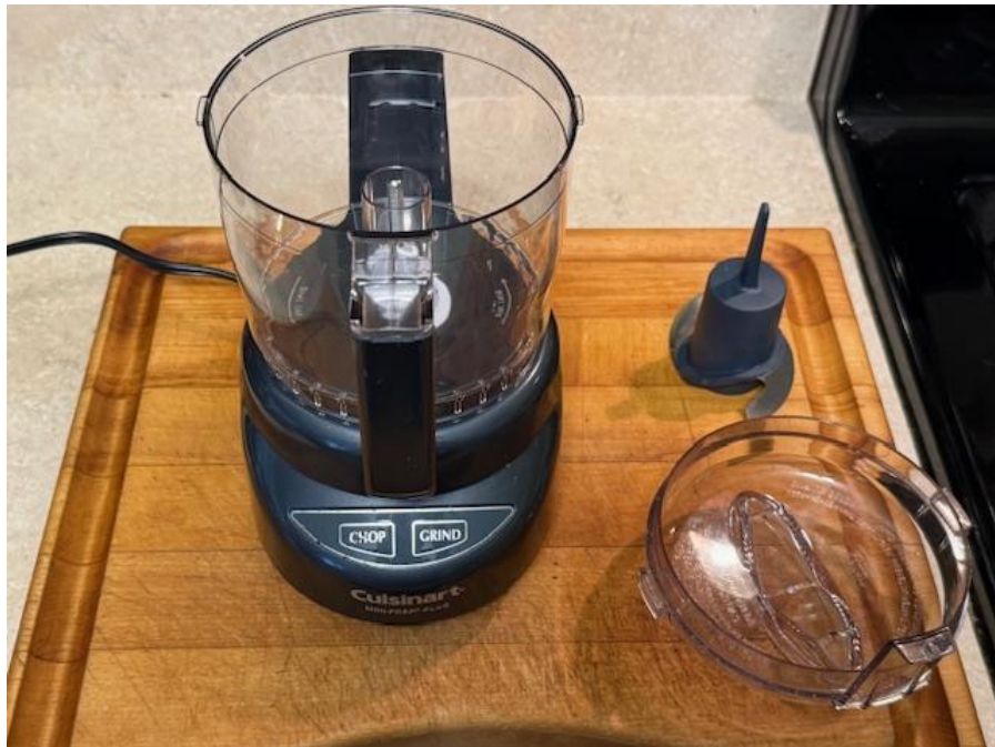
Fig.3. Lock bowl in place by turning handle in direction indicated by arrows on base unit.