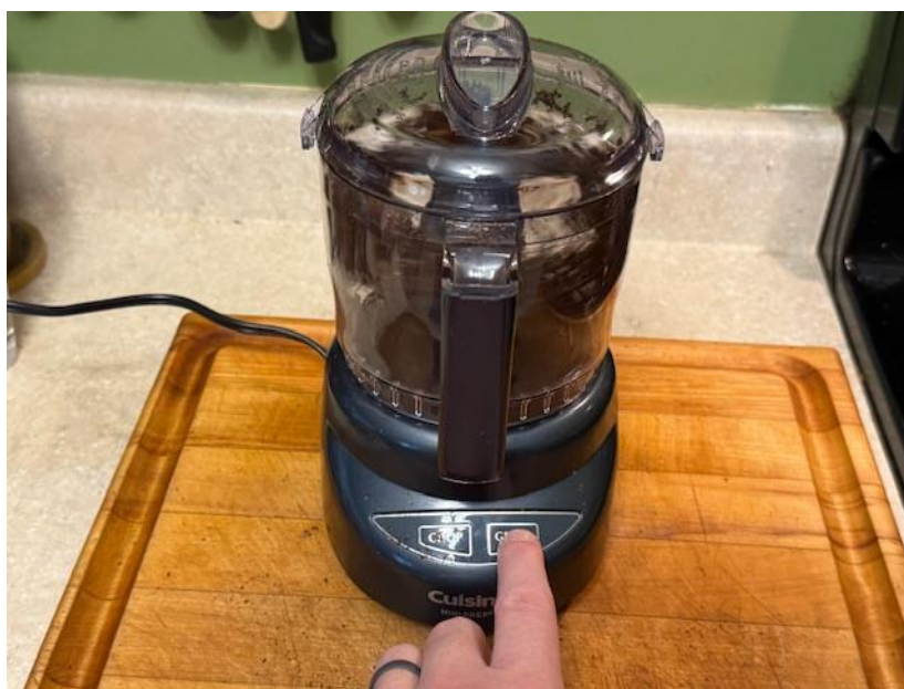
Fig. 10. Repeat grinding until beans are desired consistency.