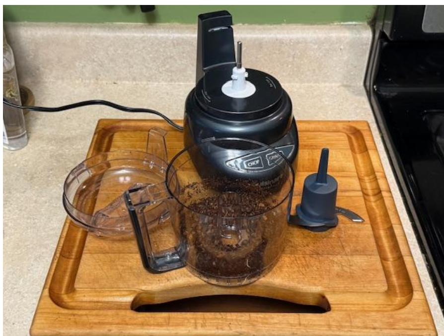
Fig. 12. Remove bowl from base unit, and use beans.

With the coffee beans now at desired consistency, they can be used in the appropriate coffee maker