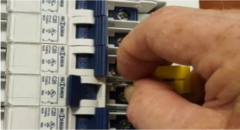
FIG 2 STEP 2 – APPLYING LOCKOUT

STEP 3: Slip the retainer pins into the two holes and release.