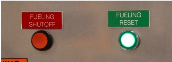
FIG 1 FUELING SHUTOFF AND FUELING RESET BUTTONS

If your system has a remote CCC, find a suitable location for the fuel shutdown/fuel reset station (usually mounted underneath the counter at the checkstand). Verify that the fuel shutdown button will not be in an area where it will accidentally be bumped, as this will shut down all fueling operations.