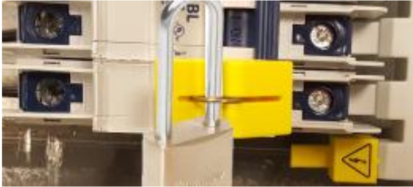
FIG 2 STEP 5 – BREAKER LOCKED OUT

STEP 5: With the lockout loop exposed, apply your padlock lock to the device. The lockout will take a lock with approximately a 5/16" shank. If you have a TAG-OUT procedure in place, apply notice at this time.