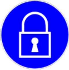
FIG 2.2.1-1 LOCKOUT LABEL