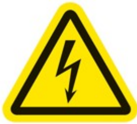
FIG 2.2.1-2 HIGH VOLTAGE WARNING LABEL