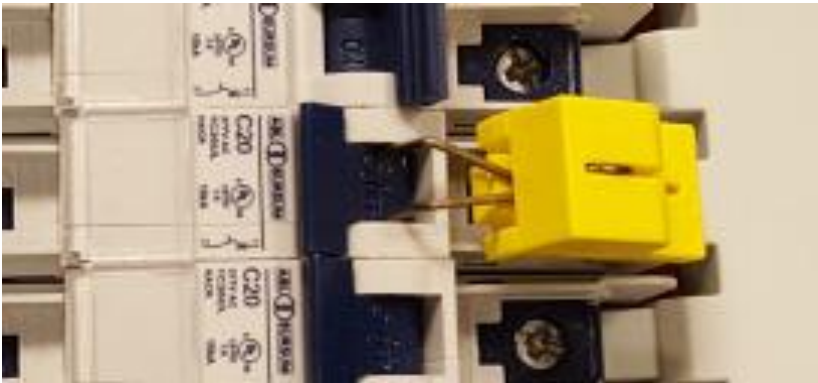
FIG 2 STEP 3 – LOCKOUT ATTACHED

STEP 3: Slip the retainer pins into the two holes and release.