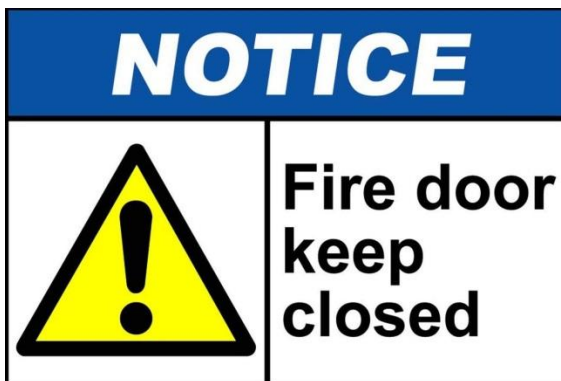
FIG 2.2-1 TYPICAL NOTE LABELS