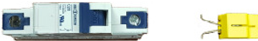
FIG 1 TYPICAL CIRCUIT BREAKER AND BREAKER LOCKOUT/LOCKON ADAPTOR

The breakers for this panel are capable of being locked out during maintenance operations or, if otherwise required, of being locked in the ON position.