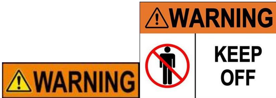
FIG 2.2-3 CAUTION LABEL