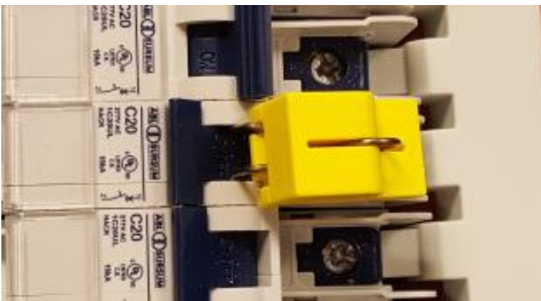
FIG 2 STEP 4 – LOCKOUT IN PLACE

STEP 4: Now raise the tab of the lockout and push down towards the retaining clips. The body will slide down over the clips, and the lockout loop will appear near the top.